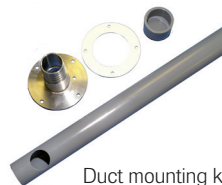
Duct mounting kit