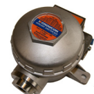
Auxiliary junction box